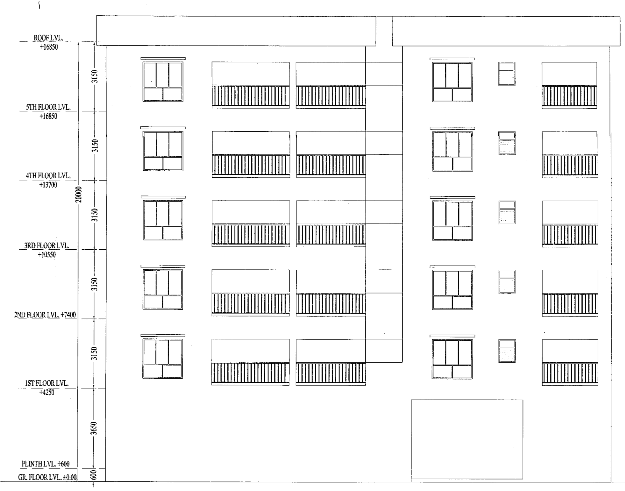
SOUTH SIDE ELEVATION