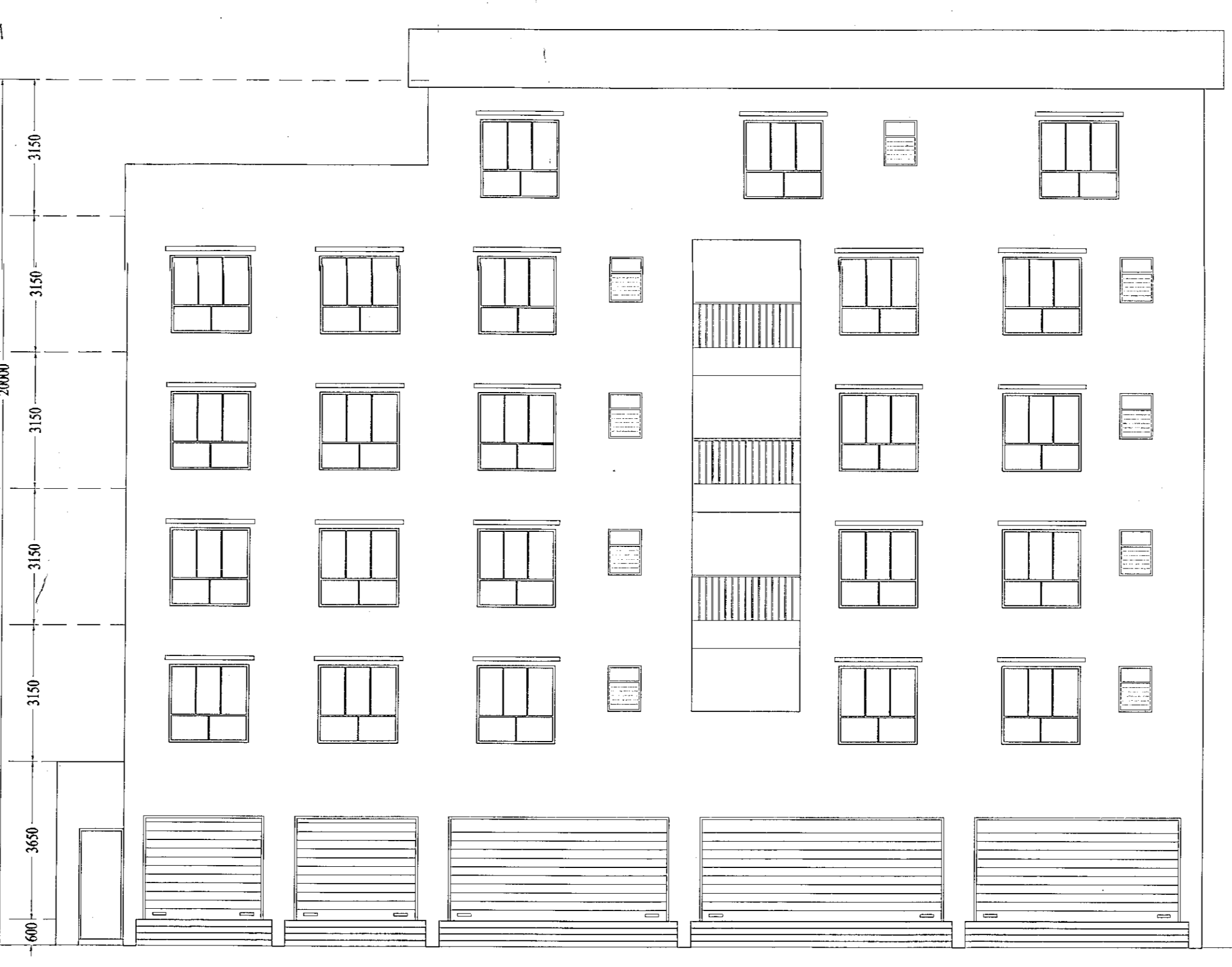
NORTH SIDE ELEVATION