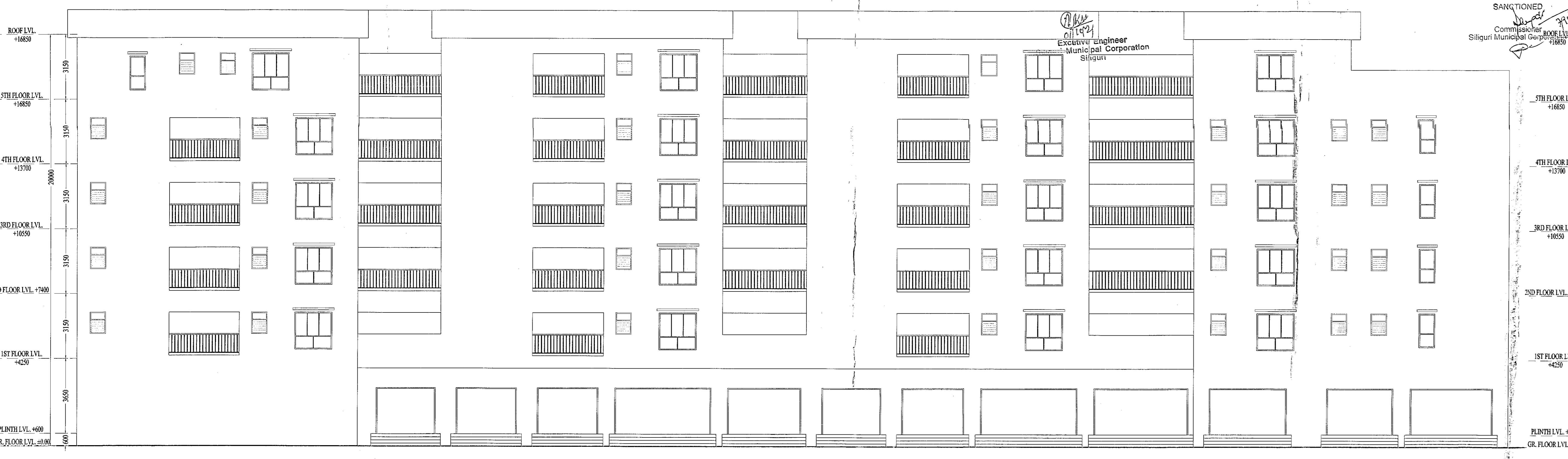
EAST SIDE ELEVATION

Valid for Three Years From the Date of Sanctioned. 22.12.21